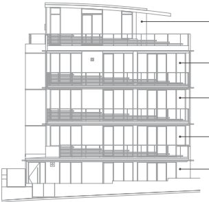
3 The Terrace

2-Bedroom Living area: 1,550 Sq. Ft. Outdoor area: 358 Sq. Ft. Storage: 81 Sq. Ft.